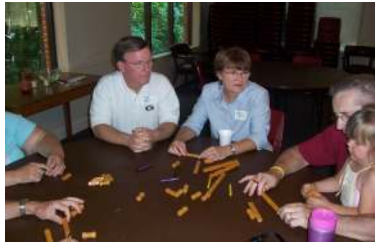
Board members and guests come together at the last community building event to announce the impending arrival of L'Arche in Atlanta.

It has been said that the pace we live at is often not the pace of our spirit. In L'Arche, we often speak of this pace as “L'Arche Time.” Those of us that are without intellectual disabilities often find it very difficult to reset our internal clocks to feel secure working at L'Arche-speed. Our core mem-